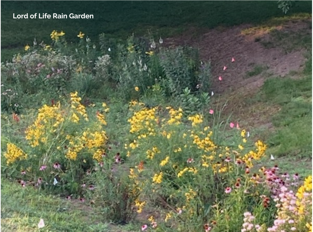
Lord of Life Rain Garden