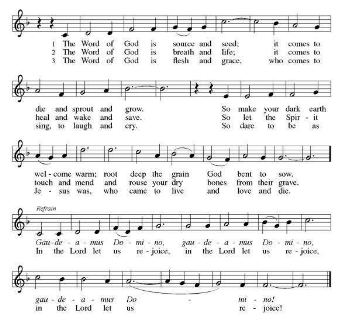
Text: Delores Dufner, OSB, b. 1939 Music: David Hurd, b. 1950 Text © 1983, 1993 Sisters of St. Benedict, St. Joseph, MN, Admin. Augsburg Fortress Music © 1995 Augsburg Fortress Used by permission OneLicense #A-718383