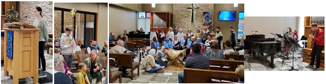
Brown Bag Christmas Pageant

This year will most certainly be exciting! Let's embrace together what "will be the beginning" means for us!